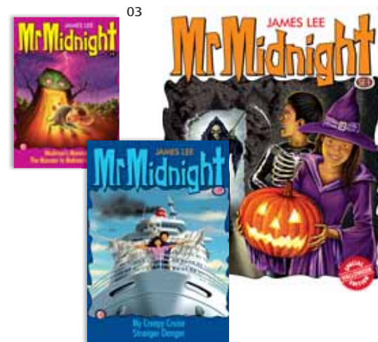
03 : Published by Flame Of The Forest Publishing, Mr Midnight , a series of horror/suspense stories for children by James Lee, has sold more than 2 million copies.

An integrated series of incentives and programmes has been devised to support the development of a sustainable and digitally-equipped publishing industry. They include: