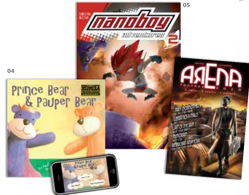
07 : Users can merge the real and virtual worlds and experience a whole new way of learning and storytelling through educational and interactive applications developed by MXR Corporation Pte Ltd, a leading proponent of Mixed Reality technology in Singapore.