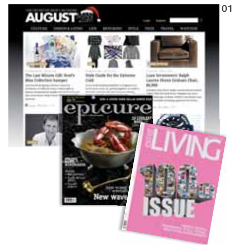
01 : Magazine publishers such as CR Media, Magazines Integrated and Expat Living have enhanced their connection with readers through digital offerings, ranging from exclusive web content to social media presence.

As the lead agency for the development of Singapore's media industry, the Media Development Authority of Singapore (MDA) is committed to catalysing growth in the country's publishing sector through three strategic approaches: internationalisation , digitalisation and multiplatform extension .